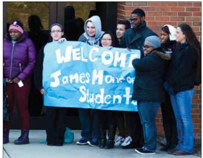
At left, students from other schools in the district created encouraging posters that decorated the walls of the new school building. Above, MCC students welcome the James Monroe children on their first day back.