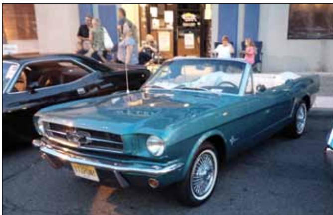
A 1965 Mustang, one of the cars that will be at the Classic Car Show.

Refreshments will be sold at 1964 prices.